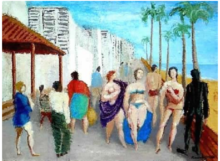
Miami Beach I. Oil on canvas, 1990. 92 x 73 cm.

(Please note that these pictures' colors may lack accuracy from their originals)