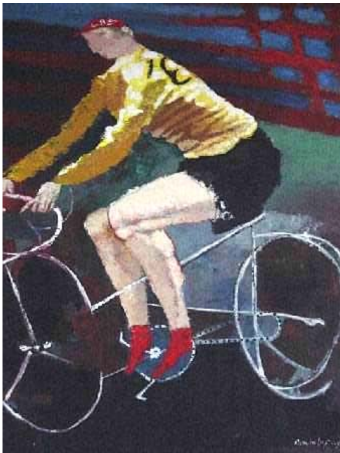
Ciclista (Cyclist). Oil on canvas, 1969. 146 x 114 cm.