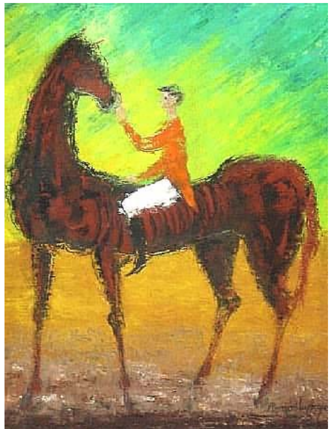
Jinete (Horse Rider). Oil on canvas, 1993. 92 x 73 cm.

His interesting use of colour to flatten the shapes of his humans and animals adds considerable impact