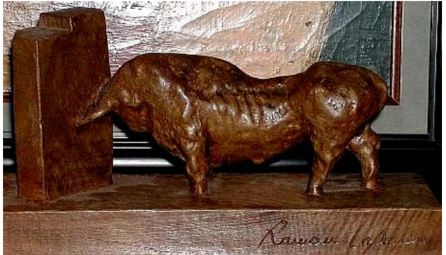
Contra el burladero (Against the Burladero ). Carved wood, 1968. 27 x 13 x 10 cm.

His small bronzes are movingly executed, a rough- crumbled texture emphasizing an unusual cutout quality