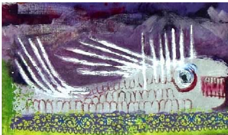
Pez (Fish). Oil on canvas, 1992. 34 x 69 cm.

Ramón Lapayese paints reality and charming popular scenes with energy, enthusiasm and acute observation