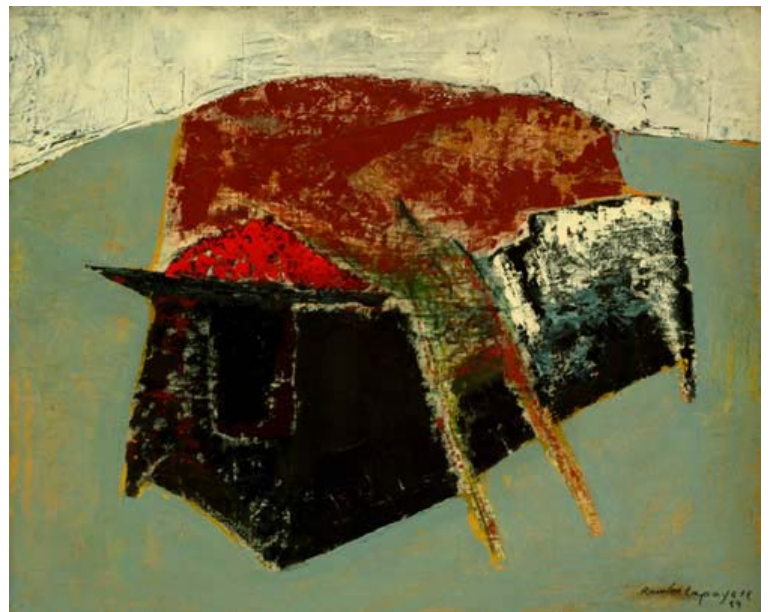
Toreando con la mano izquierda (Left Hand Pass). Oil on canvas, 1959. 73 x 60 cm.