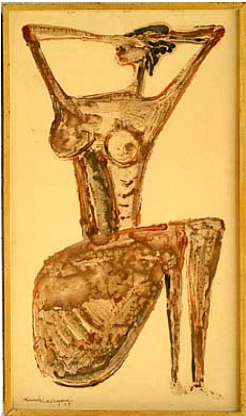
Desnudo sentado (Seated Nude). Mixed media on paper, 1958. 100 x 58 cm.